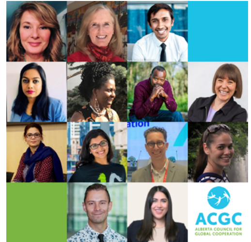
New ACGC board members