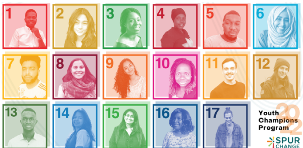
Youth Champions cohort 3 (2022)

Learn more about the Youth Champions Program here!