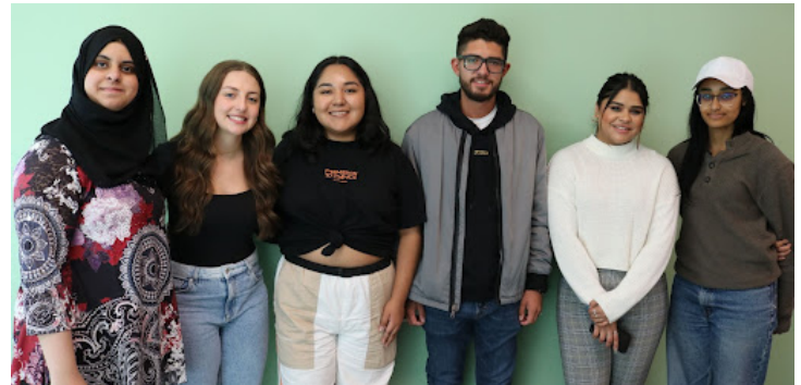
SDG Hub cohort 5 at in-person retreat