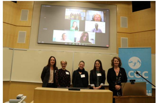
Voice and Inclusion in Social Innovation panelists (on screen) and their local Alberta partners (in room).