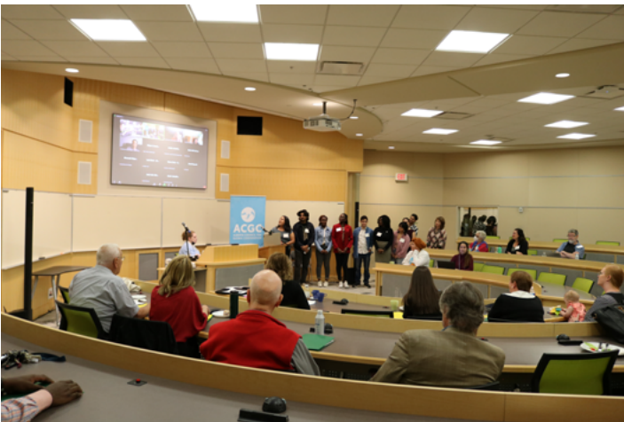
ACGC's 2022 Global Connect youth presenting at AGM