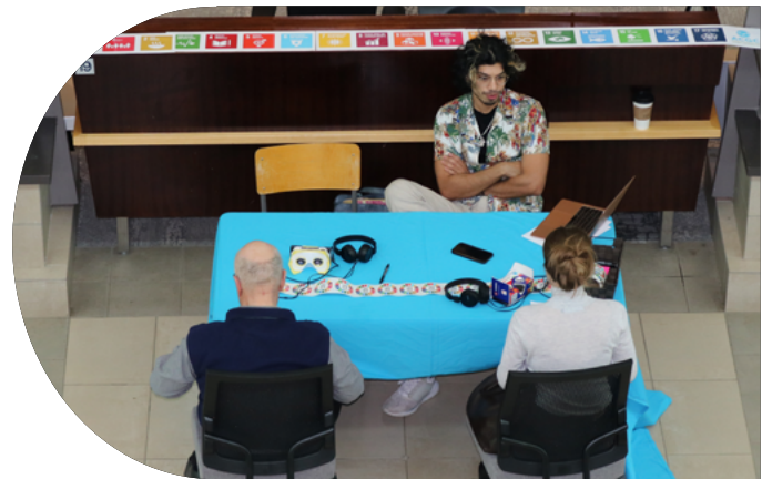
Insight 360 VR headset station at the Innovation Fair