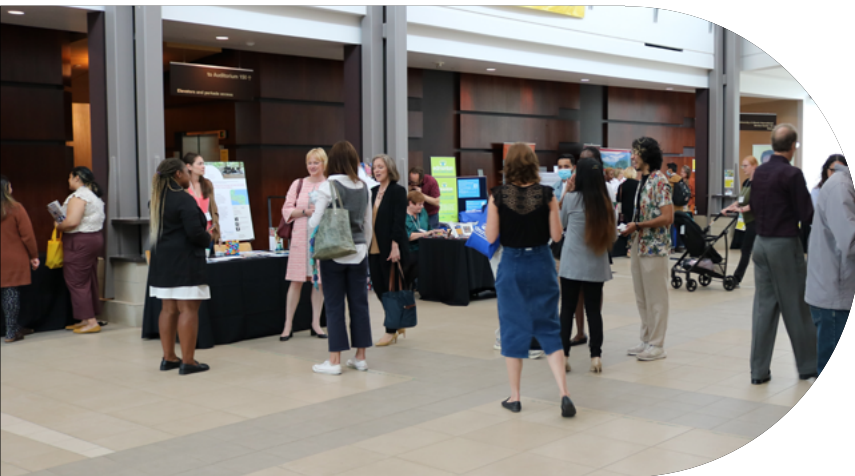
"Trailblazing in Action" Innovation Fair