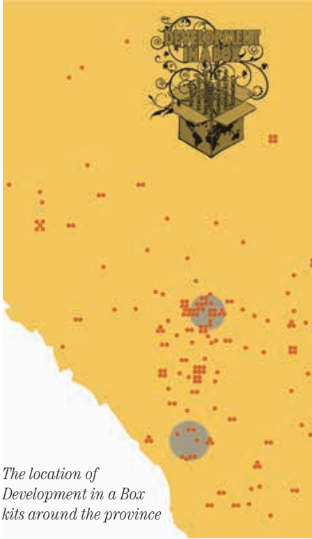
The location of Development in a Box kits around the province