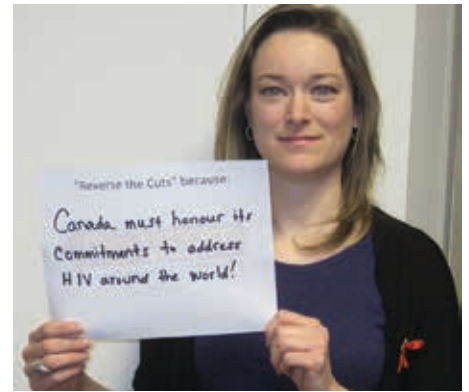
Reverse the Cuts photo campaign.

The E-Bulletin allows ACGC to regularly share information about members' events and programming, ACGC's capacity-building opportunities, job/volunteer openings, and other items of interest with ACGC members, the CSO community, and the general public. It has proven to be a successful communication tool for the Council and its members. ACGC sends out E-Bulletins on a regular bi-weekly schedule.