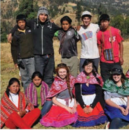
Photos this page: 2012 Change Your World youth leadership tour participants with their Peruvian partners.