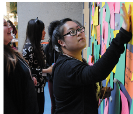
Students at the IDW Youth Day event committed to actions over the next year to carry their lessons forward.

This year's Top 30 Under 30 Magazine Launch & Gala drew youth from Edmonton, Calgary, Morinville, and Drumheller recognized for their outstanding work.