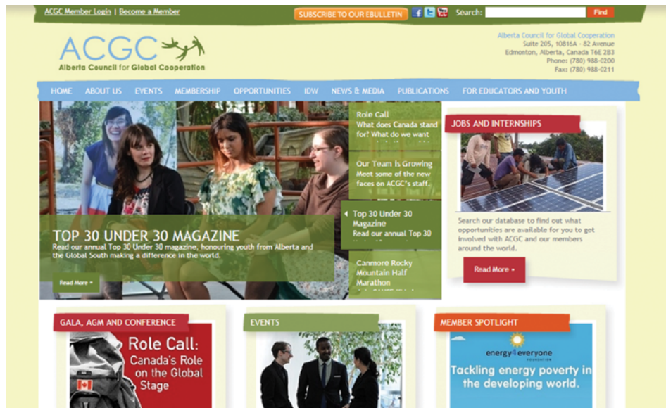
ACGC.ca is the Council's online hub for resources, news, events, and opportunities.

In the past year, we continued using social media as a key tool for sharing members' events and opportunities, communicating with the public about ACGC programs and campaigns, and informing Albertans about current