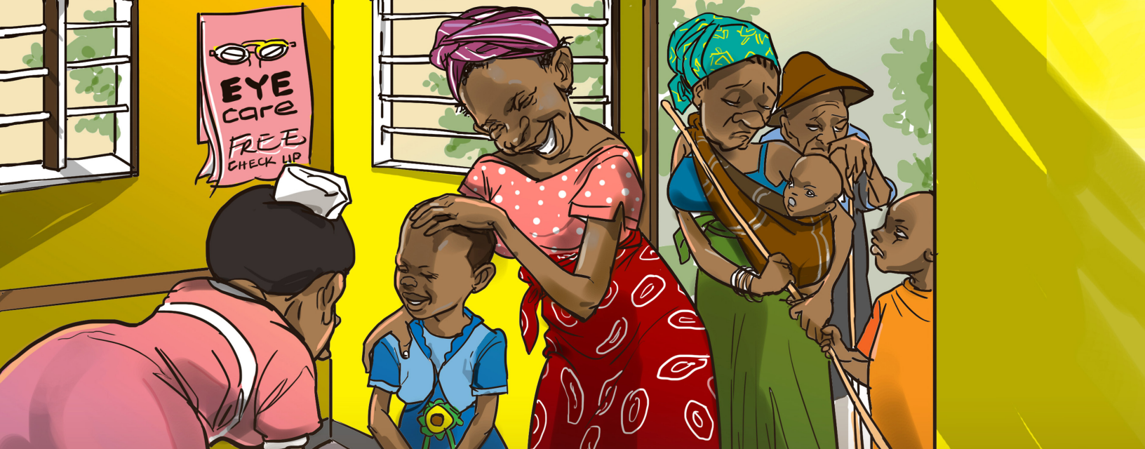
from the Together notebook story "Restoring Sight, Transforming Lives" by ACGC member Operation Eyesight