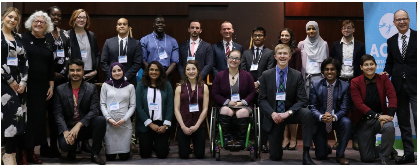
Top 30s at the Top 30 Under 30 Magazine Launch with ...

The 2018 Top 30 Magazine cover design by Amanda Ozga takes the hopeful symbol of "fingers crossed" and infuses it with a spirit of collective strength and togetherness, signaling the agency of Top 30 youth.