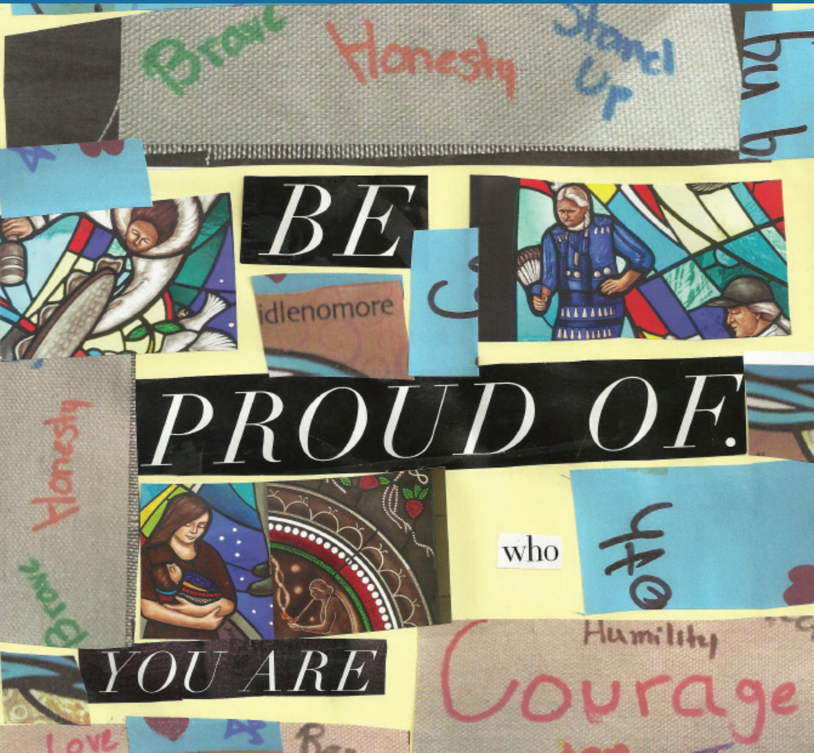
Image from the Together notebook story by ACGC member John Humphrey Centre for Peace & Human Rights "Advancing Reconciliation in Education"