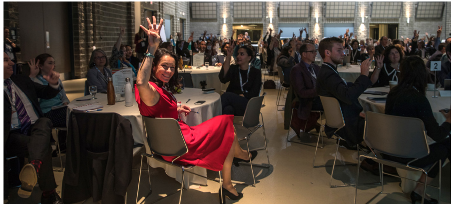
Delegates from various sectors gathered at the University of Calgary for Together 2017

270 attendees, representing 150 organizations, participated in Together 2017