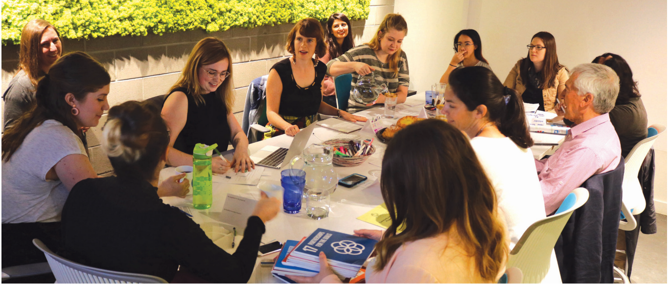
Round table discussion on strategy for the Together notebook hosted by Zag Creative with ACGC members and communications professionals