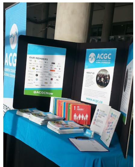
ACGC booth at Calgary Teachers' Convention