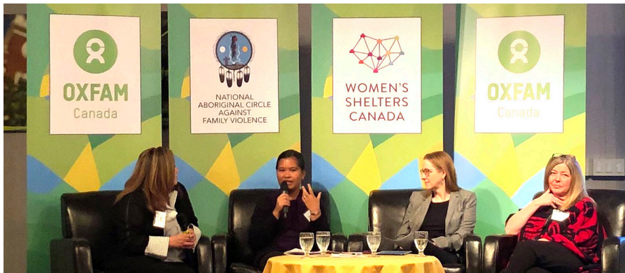
Oxfam Canada hosts a "How Change Happens" conversation, April 9 at the University of Alberta