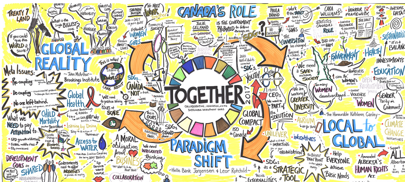
Conversations at Together 2017 captured by Julie Murray

ACGC was 1 of 5 finalists, out of 700 nominated projects from around the world, for the United Nations SDG Action Awards in Bonn, Germany