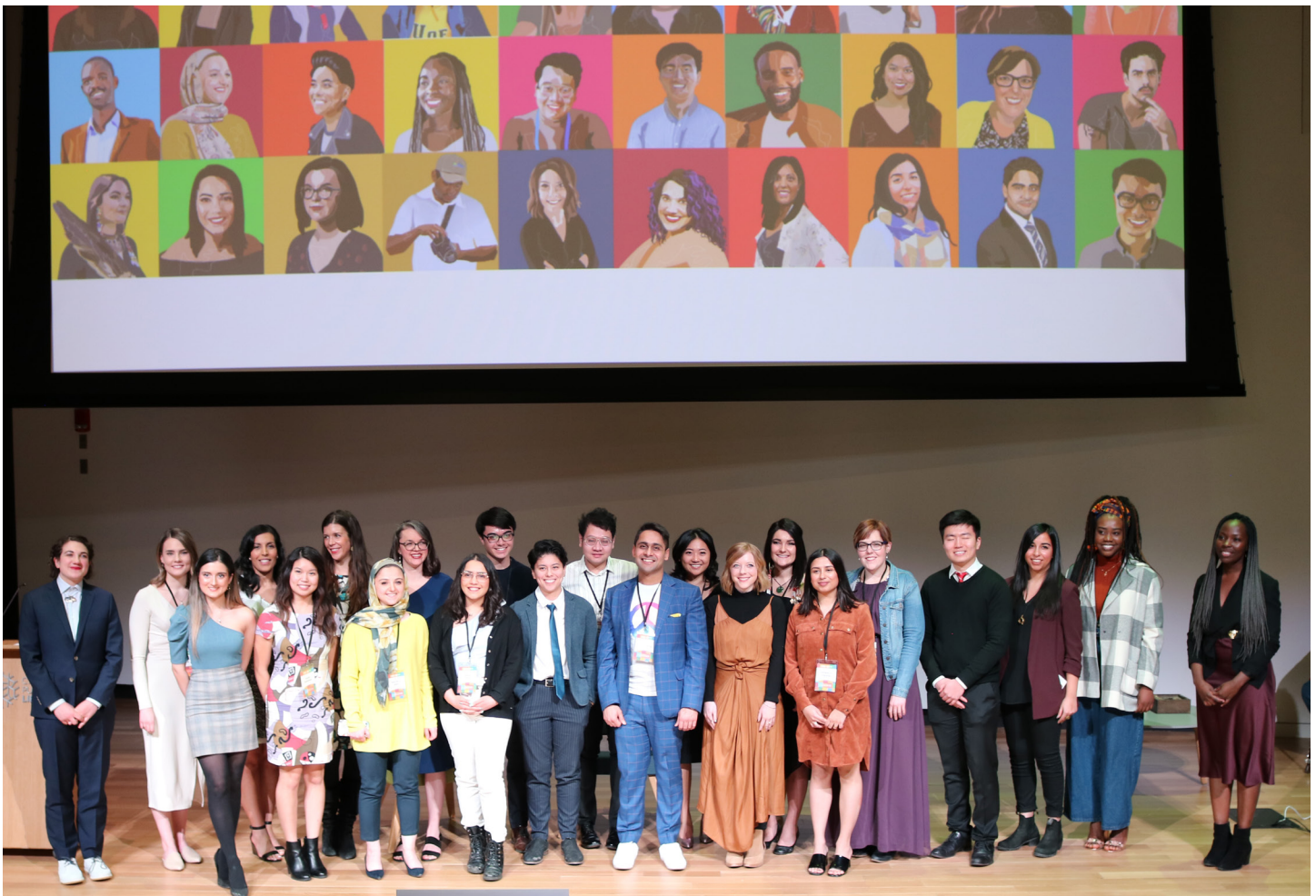
Top 30 Under 30 2020 at the Calgary Central Library

Visit the Top 30 Website at top30under30.acgc.ca