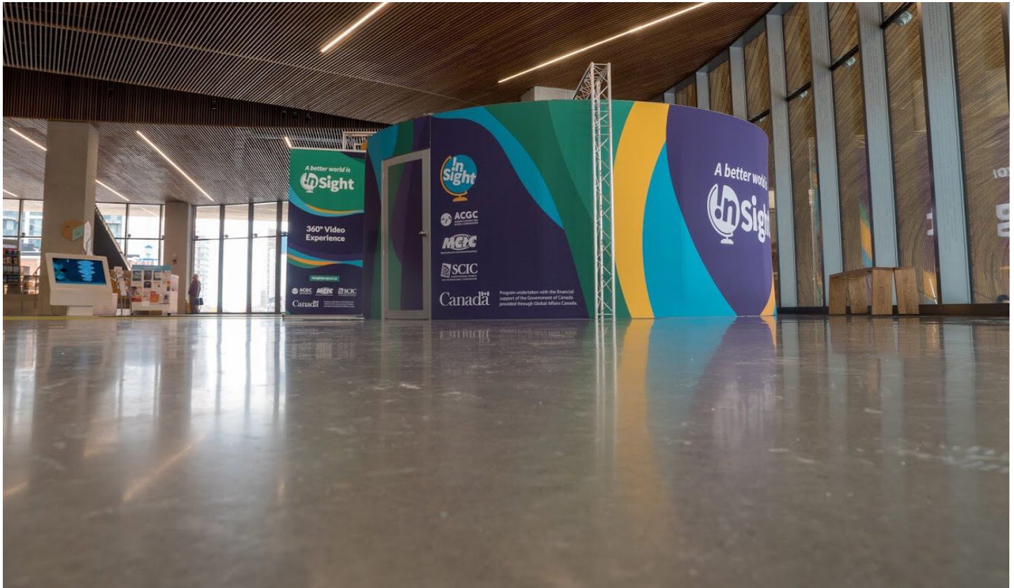
The InSight Project at the Calgary Public Library, February 2020

In January 2020, ACGC launched the ‘A Better World is InSight’ project in partnership with the Saskatchewan and Manitoba Councils for International Cooperation. The InSight Project is a 360° video cylinder installation touring schools and libraries across Alberta, Saskatchewan, and Manitoba. Through immersive 360° video and interactive workshops, InSight brings stories of global development to life for youth and members of the public. Three unique