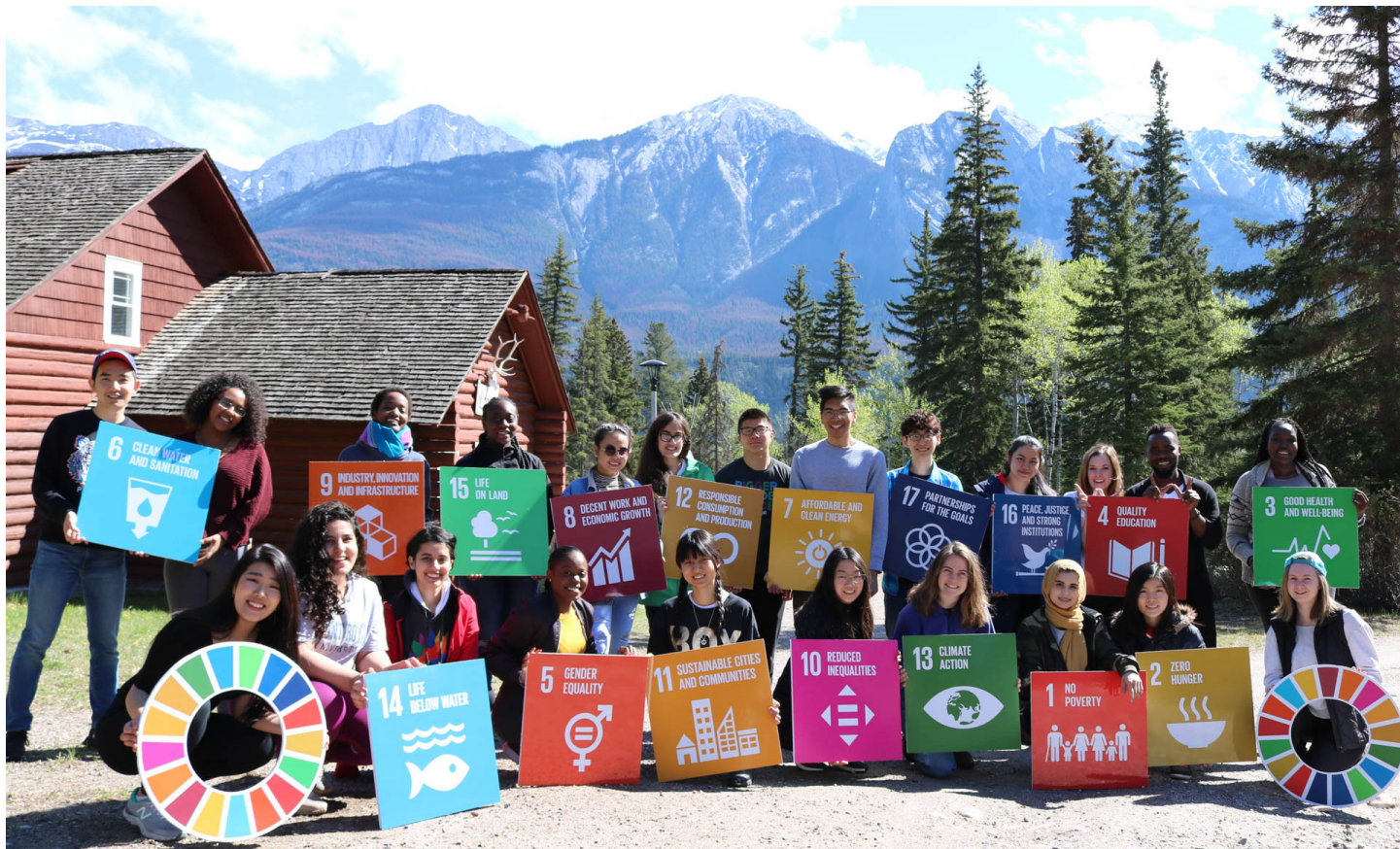
The Sustainable Development Goals Hub retreat in Jasper, Alberta in May 2019

Visit the Together Alberta website at together.acgc.ca