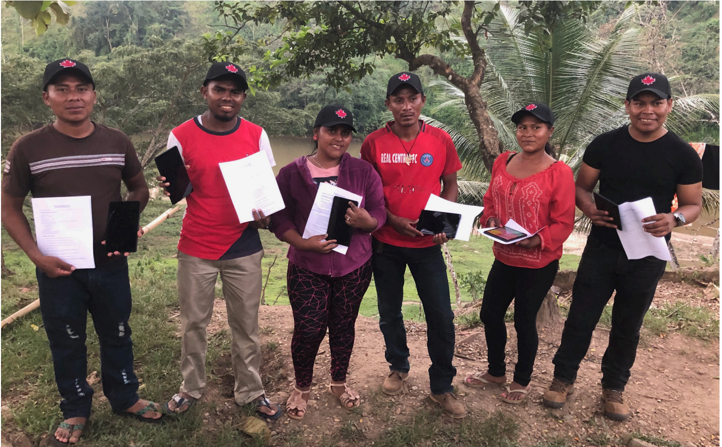
Change for Children Association: Indigenous data collectors conducting baseline study and gender analysis in Nicaragua

This year also saw the launch of the Fund for Innovation and transformation (FIT), a five-year $16.5 million national program of the Inter-Council Network administered by the Manitoba Council for International Cooperation. The program is designed to provide funding to Canadian small and medium organizations to test innovative solutions to specific development challenges that advance gender equality and empower women and girls in the global