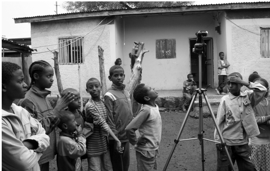
Students at LiGA Primary School, Ethiopia

Upon returning home to Canada ACGC hired a video production company to take care of the editing and creation of a 12 minute film that could be shared with Alberta schools across the province. The youth, with ACGC staff, worked with the video production company to create a touching and real encounter of the Change Your World Youth Leadership Tour . This video was shared with over 15 schools and 35 classes throughout the Alberta school tour as well as through various social media outlets.