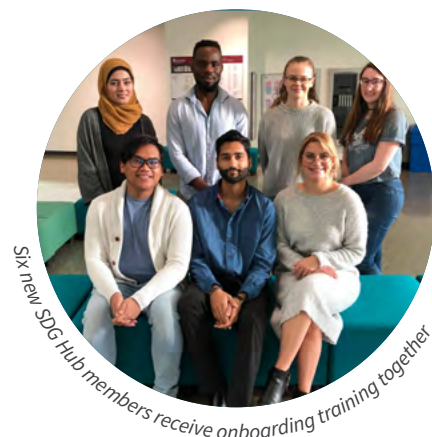
Six new SDG Hub members receive onboarding training together

The 2018-2019 Annual Report is available on our website.