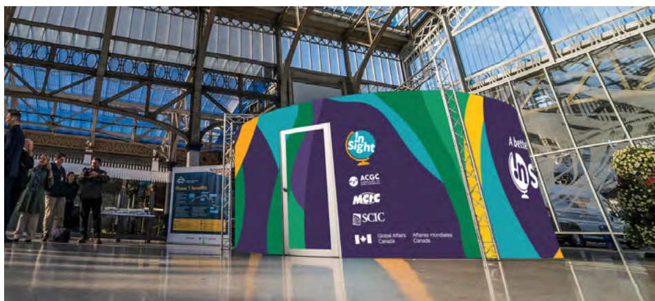
A mock up of the InSight 360 video cylinder, set to launch nationally in February.

Save the date and join us on Tuesday, February 4th, 2020 at 2:00pm at the Calgary Central Library for the National Launch of this new initiative.