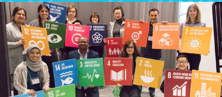
Roundtable participants post with the SDGs in spring of 2019.