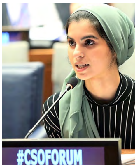
Zainab speaks at the UN General Assembly