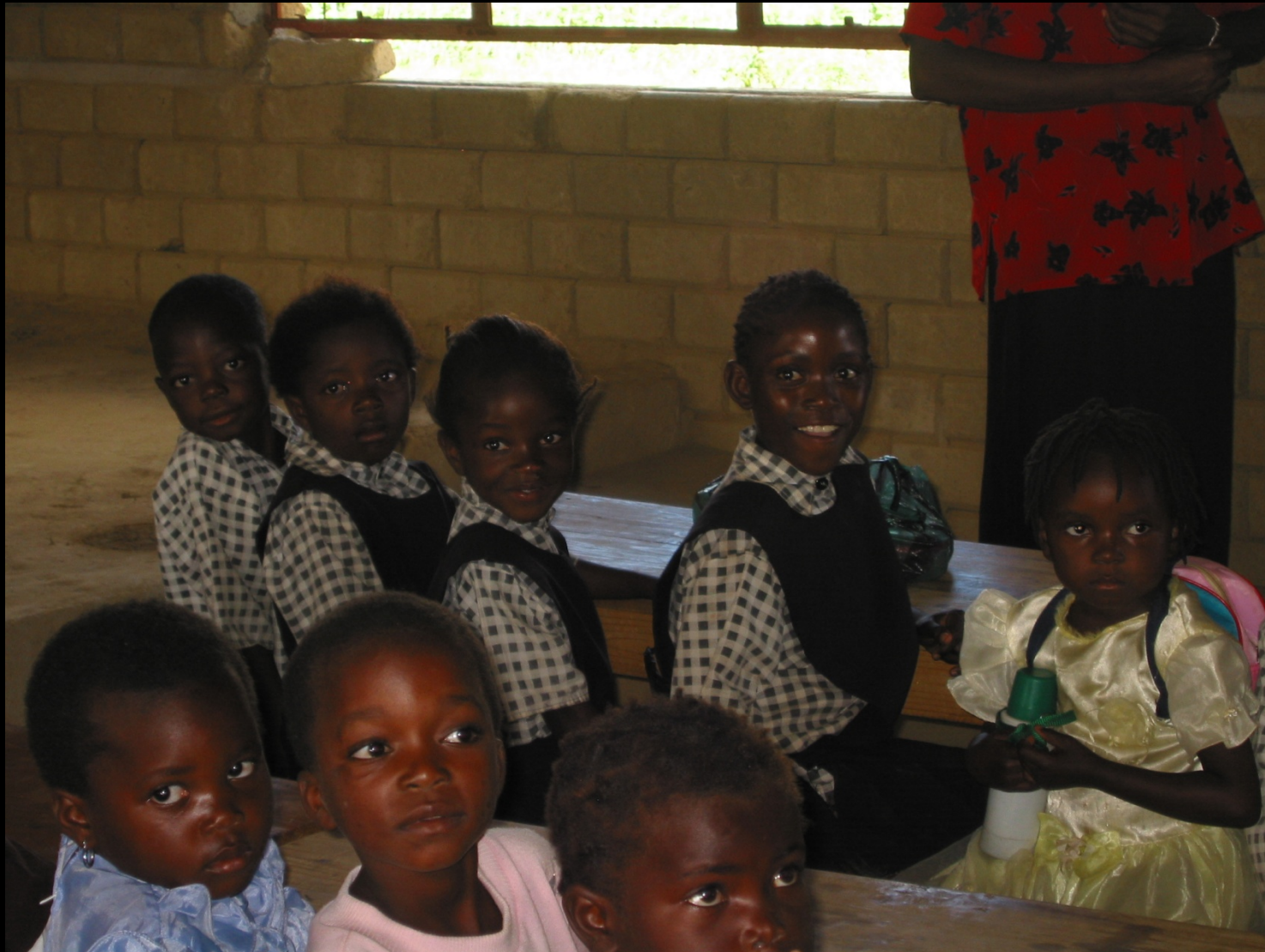
A classroom in Zambia