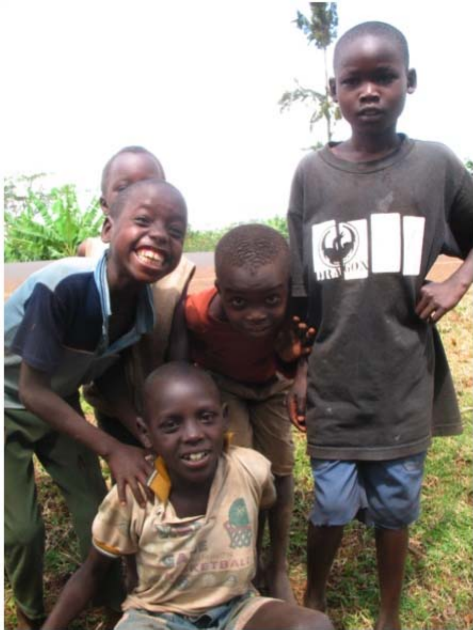
Students in Uganda